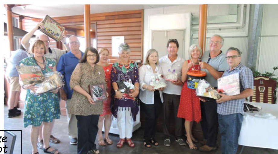
The happy raffle prize winners with their loot