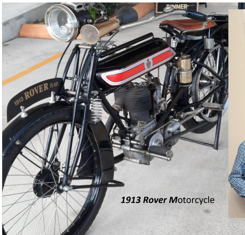
1913 Rover Motorcycle