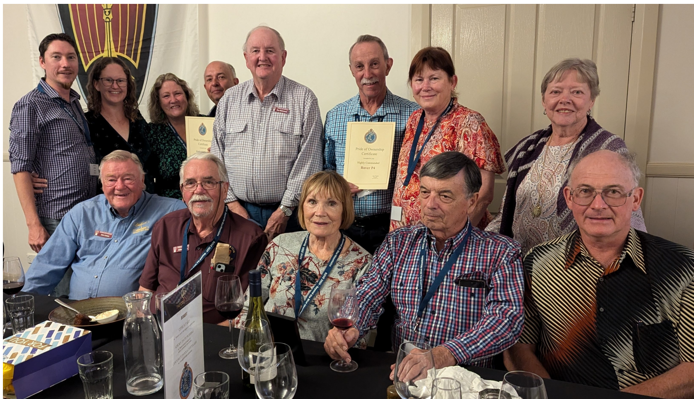
The Queensland contingent at National Rover Rally, 1-4 November 2024.