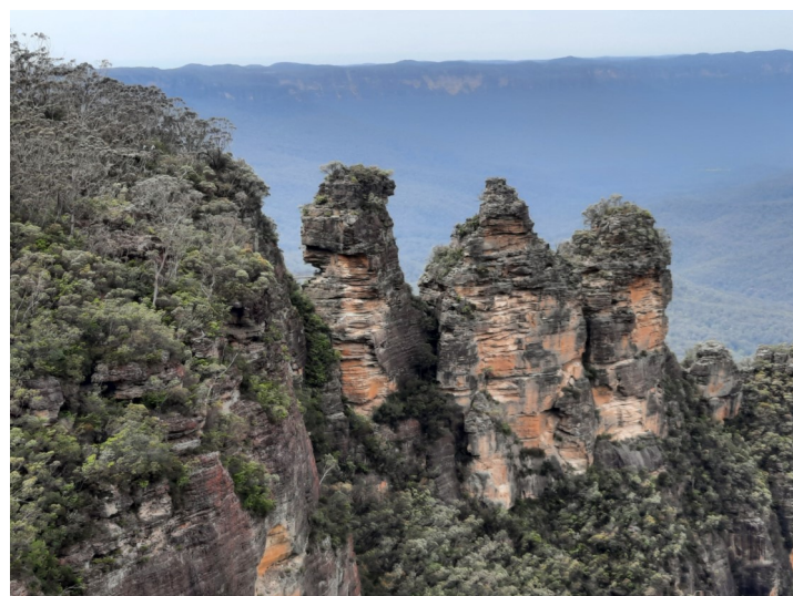
View of The Three Sisters, Katoomba