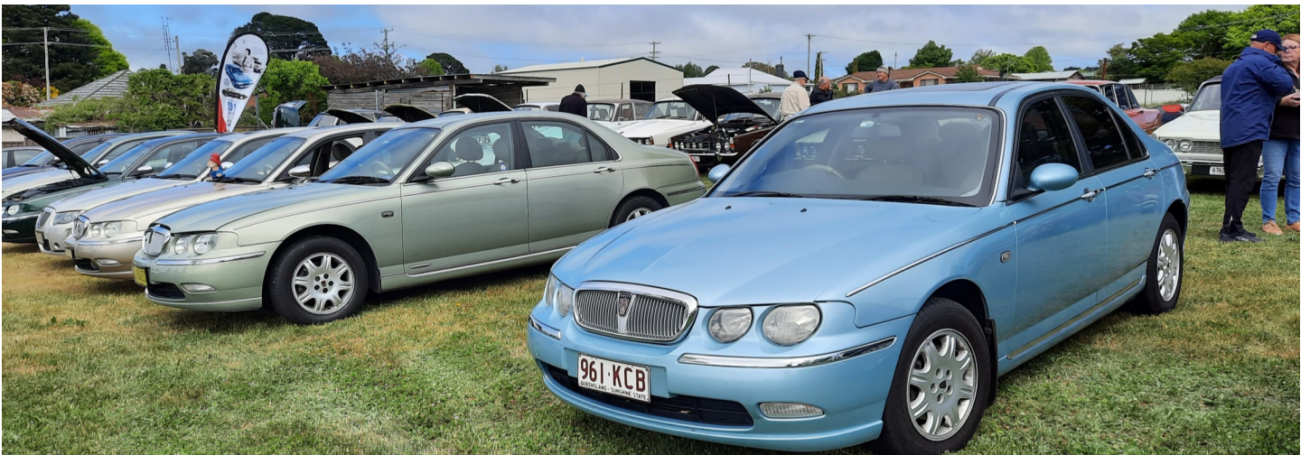
Rovers at Bathurst