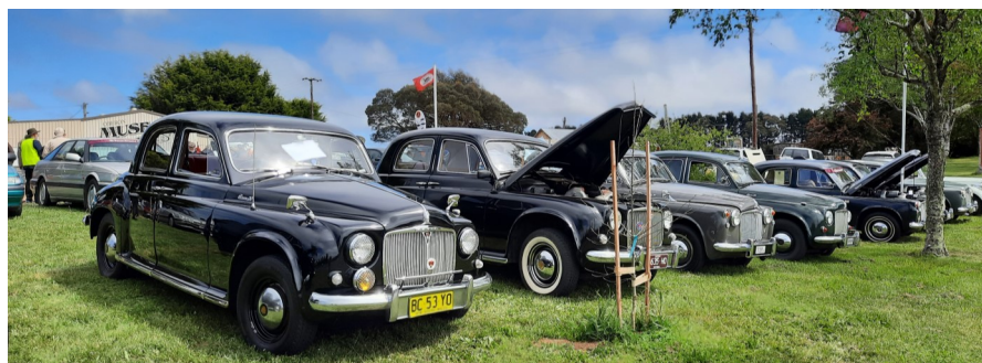
Selection of Rover P4s and P5s on Display