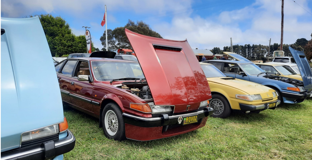
SD1s and Rover 75s On display